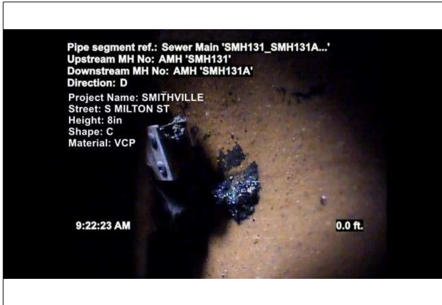
At: 0 ft. AMH - Manhole Joint: No SMH131