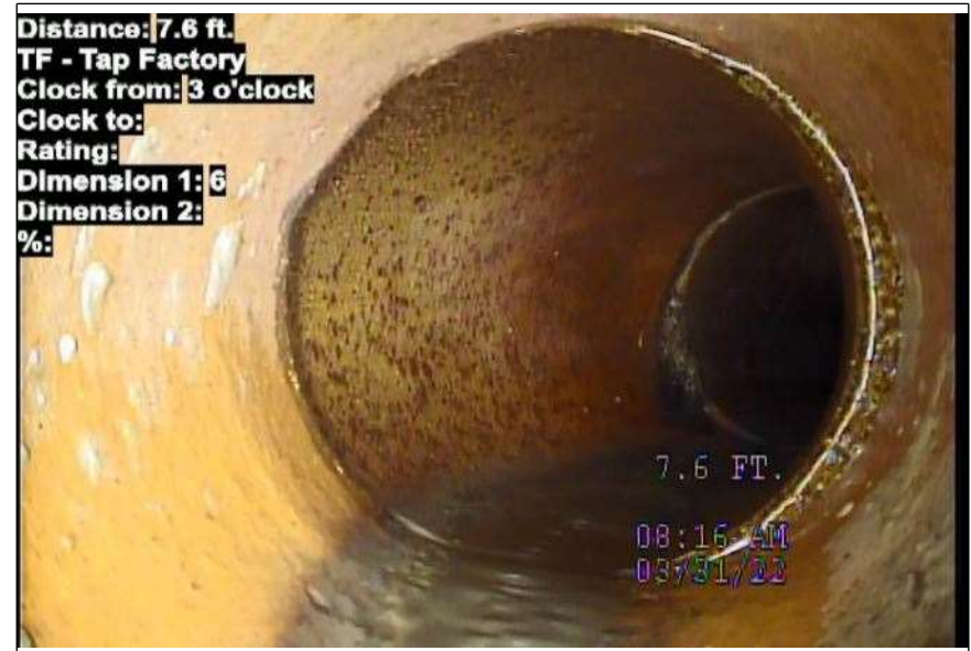
At: 7.6 ft. 3/. TF - Tap Factory Joint: No