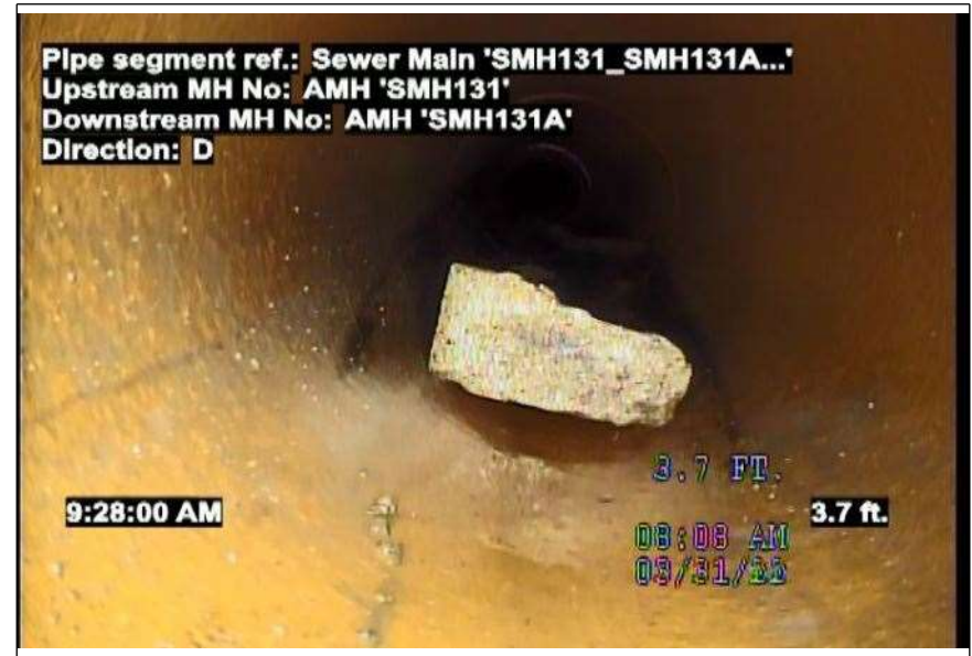
At: 0 ft. MWL - Miscellaneous Water Level Joint: No 5%