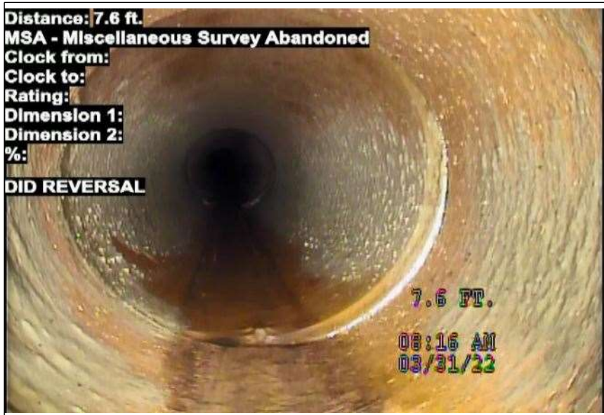
At: 7.6 ft. MSA - Miscellaneous Survey Abandoned Joint: No REVERSAL COMPLETED