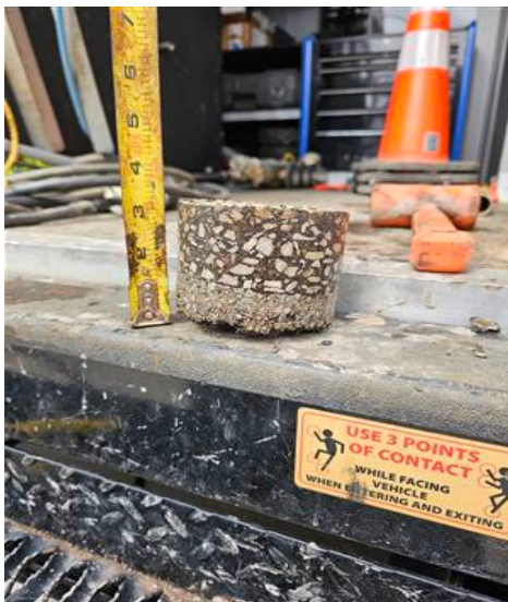
#5. intersection Day St & Erie St.