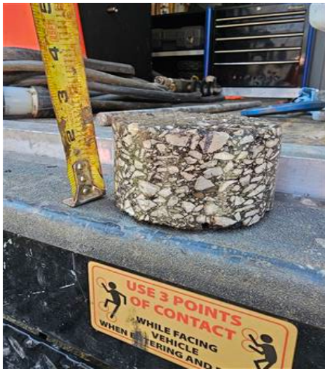
#1. 280 Salem St.