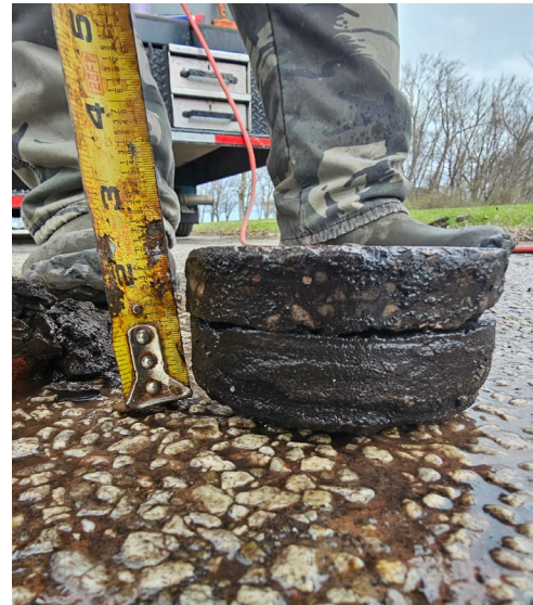
#4. 884 Day St.