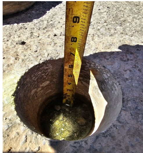
#2. intersection Rowe St. & Salem St.