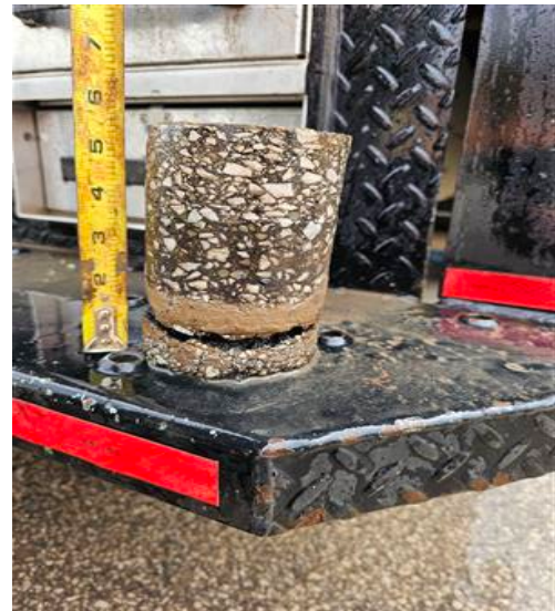
#6. intersection Main St & Broad St.