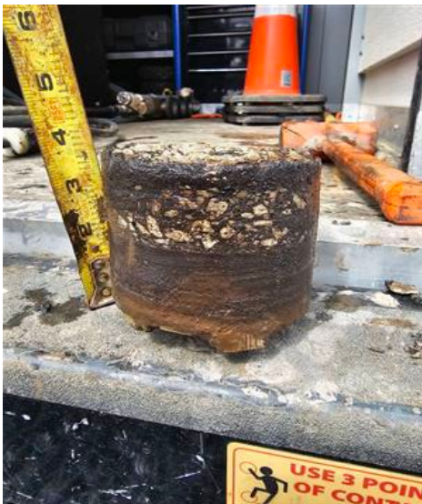
#3. intersection Day St & Pearl St.