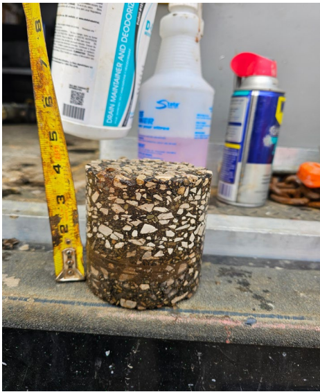
#7. 369 Main St.