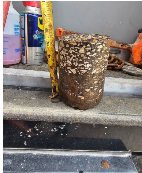
#8. 305 Main St.