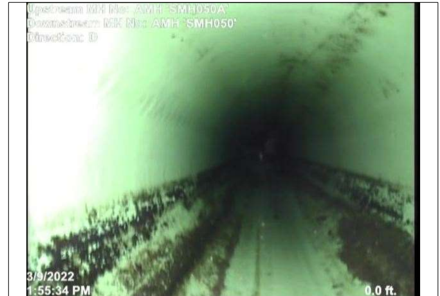
At: 0 ft. MWL - Miscellaneous Water Level Joint: No 5 %