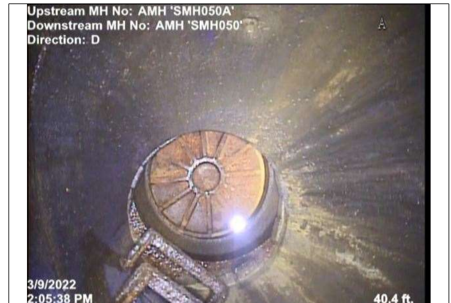
At: 40.4 ft. AMH - Manhole Joint: No SMH050