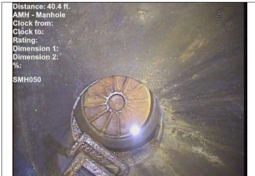
At: 40.4 ft. AMH - Manhole Joint: No SMH050