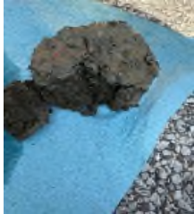
SUB BASE MATERIAL