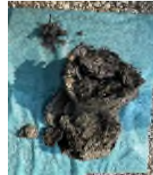
SUB BASE MATERIAL